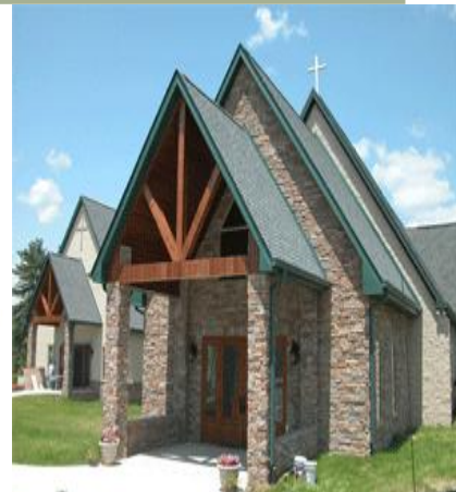
New Our Lady of Perpetual Help Church, LaFollette

Thank you for supporting the Catholic Foundation of East Tennessee!